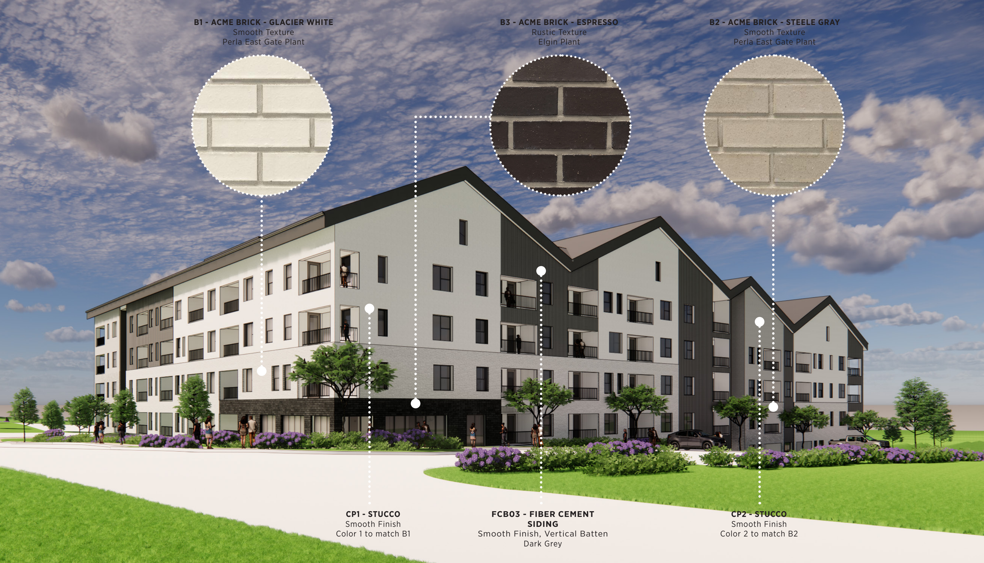
CP1 - STUCCO Smooth Finish Color 1 to match B1