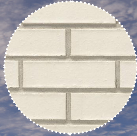
B1 - ACME BRICK - GLACIER WHITE Smooth Texture Perla East Gate Plant